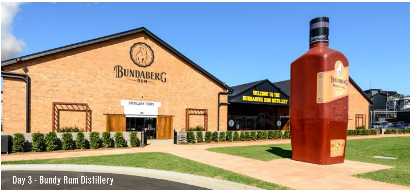
Day 3 - Bundy Rum Distillery