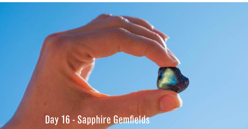
Day 16 - Sapphire Gemfields