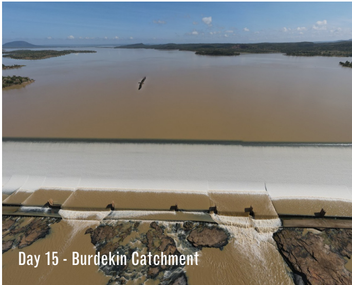
Day 15 - Burdekin Catchment