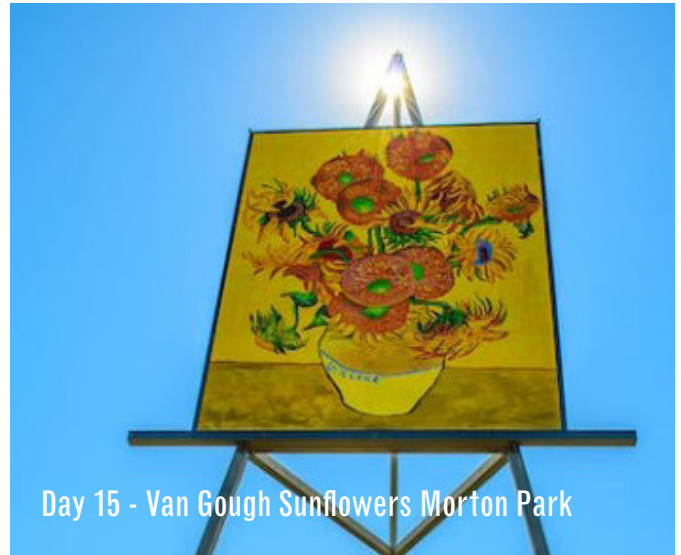
Day 15 - Van Gogh Sunflowers Morton Park